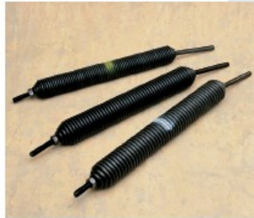
C3M Set springs for CS500/CS650