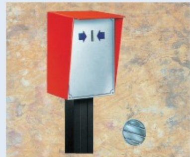
CEDAGET Token machine with column and anchor base