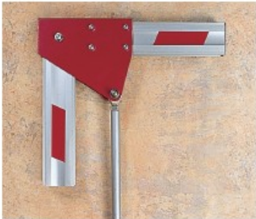
CSN Beam articulated joint