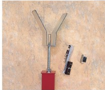
CESA Fixed support with Electric lock