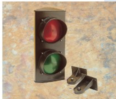
Red & green traffic lights