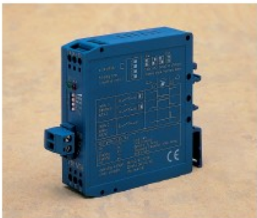
VEK M1H Loop detector