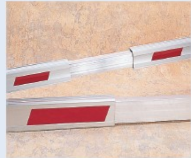
Joint for AL500 beam CRB2 joint for AL650 beam