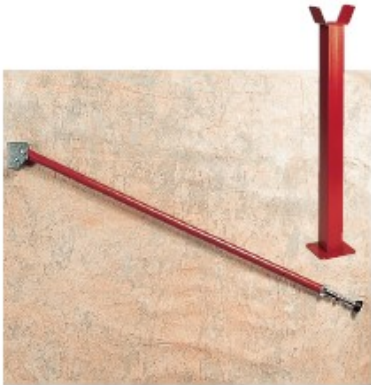
CE.AF Moveable rod support CE.AM Fixed beam support